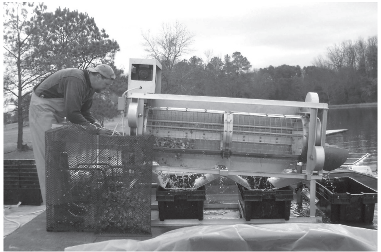
Side view of sorter, oysters are washed as they are graded

The sorter runs off of electricity and can be plugged in to any standard outlet or generator. (A hydraulic option is also available.) While the sorter can be run dry, it easily connects to water pumps of all sizes.